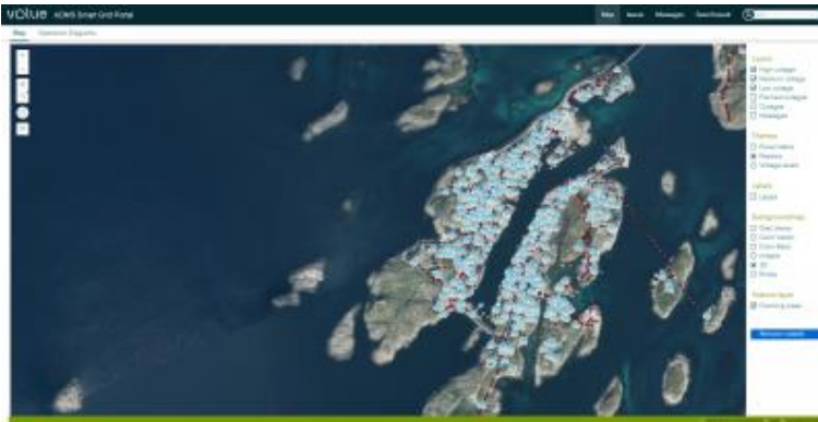
Volue’s ADMS Smart Grid Portal.