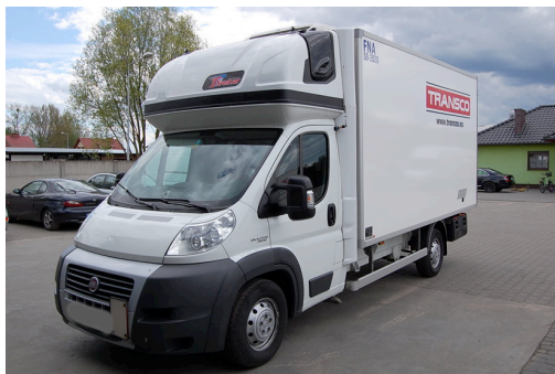
Transporter for GDP-compliant carriage of pharmaceuticals to Eurasia

TRANSCO offers GDP-compliant pharmaceutical transports to Eurasia. The map presents a selection of example connections (source: TRANSCO Berlin Brandenburg GmbH)